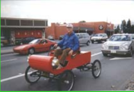
1904 Curved Dash Olds (replica)

"Promoting the use of electric vehicles since 1967"