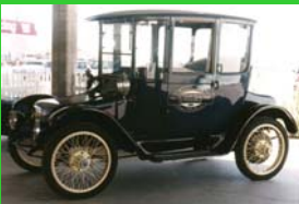
1915 Detroit Electric Automobile