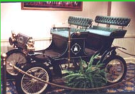
Walt Disney's 1901 Oldsmobile EV