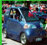
Commuter Cars Tango