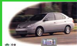
Toyota Prius Hybrid