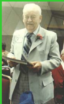
Walter Laski, EAA Founder

"EAA EV drivers have logged over 10 million clean miles"