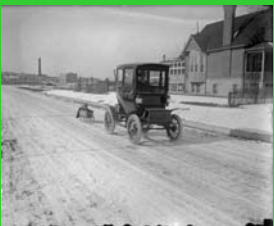
EV in 1912